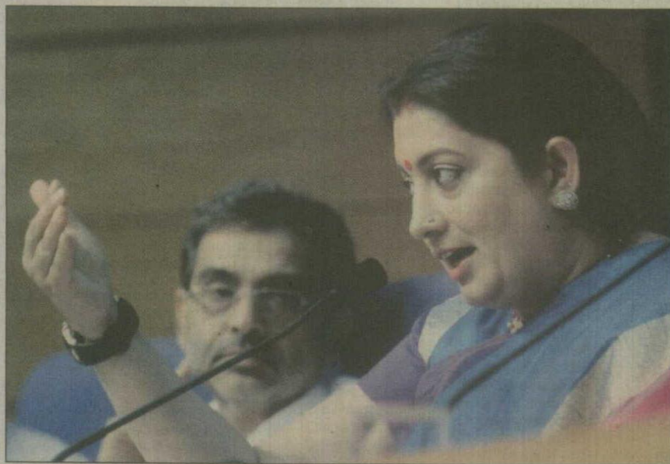
Irani at the press meet on two years of Modi government in Delhi Friday.

Subramanian was the chairperson of a five-member committee tasked with assimilating feedback, collected by the HRD