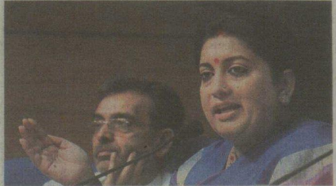
Union Minister for Human Resource Development Smriti Irani and Minister of State Upendra Kushwaha addressing a press conference in New Delhi on Friday KAMAL NARANG

cy will not become an attempt to become the legacy of one individual who seeks a headline... The recommendations have to be shared with the States first before it is made a draft policy."