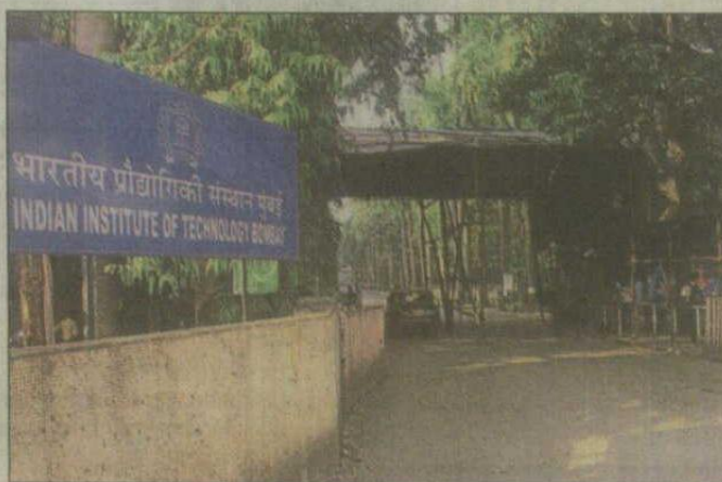
■ Startups account for 20-30% of campus hirings at IITs and IIMs

When contacted, a Flipkart spokesperson refused to comment on Friday's development, but said that some current employees are facilitating a process of offer-